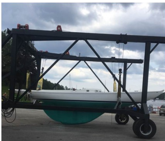
Zephyr II being launched